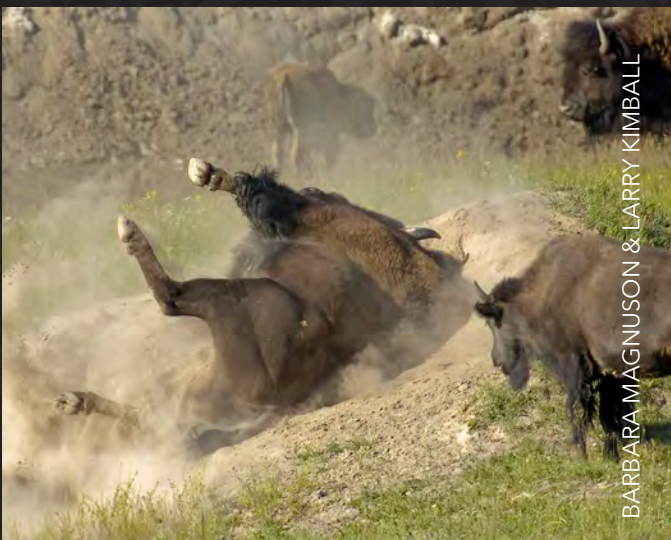
BARBARA MAGNUSON & LARRY KIMBALL

Human intolerance and management is severely curtailing the natural distribution, abundance, and migrations of wild bison and is a persistent threat and stressor within the plan area, now and for the foreseeable future. In severely curtailing bison range, the Custer Gallatin is placing the wild species at greater risk of local extinction.